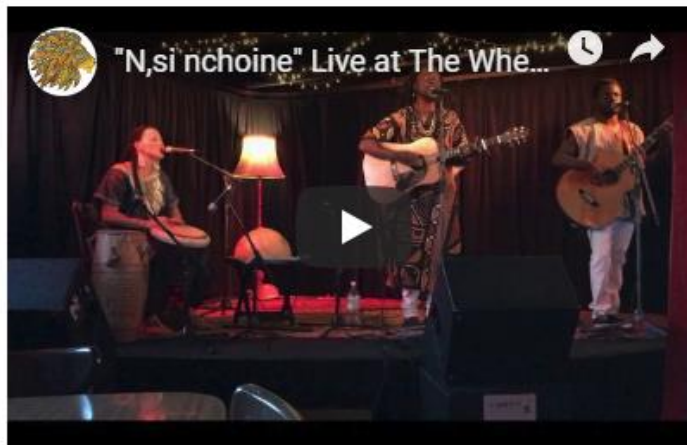
"N,si nchoine" - I Say Love You