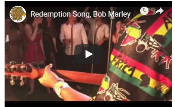
Bob, Marley's Redemption Song