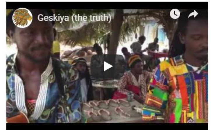
"Tarabya" - Seeking, Live at The Art Centre, Accra, Ghana